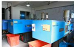
Precise Mould Development