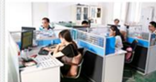
Reliable manufacturing ability to meet your design requirements