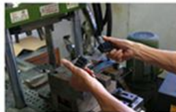
Reliable supply ability