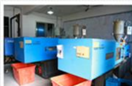
Precise Mould Development