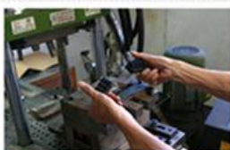
Reliable supply ability