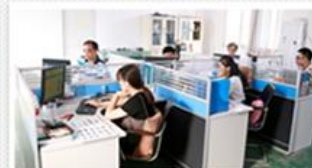
Reliable manufacturing ability to meet your design requirements